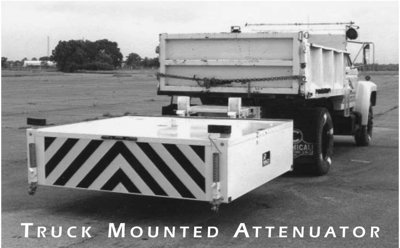
TRUCK MOUNTED ATTENUATOR