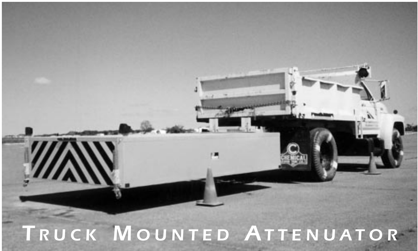
TRUCK MOUNTED ATTENUATOR